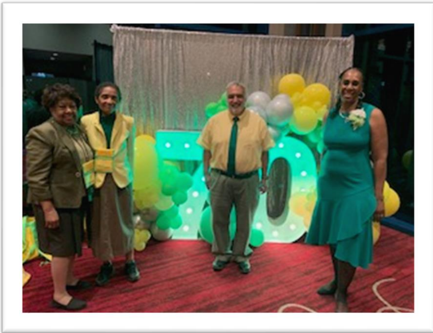
70 th Platinum Jubilee Celebration of the Northeast Region, Inc.