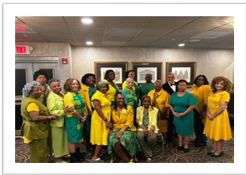
Kappa Chapter Annual Mamie Garland Scholarship luncheon April 30, 2023